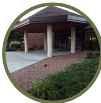
Christ Lutheran, Byron