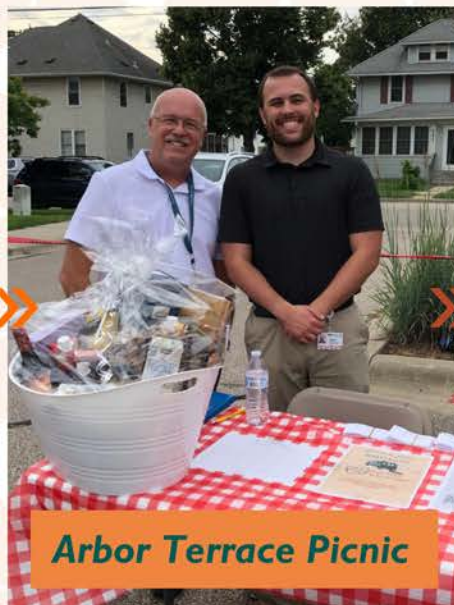
Arbor Terrace Picnic