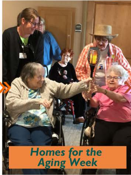
Homes for the Aging Week