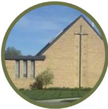
Peace United Church of Christ

We extend our heartfelt thanks to our sponsoring churches for their support of Samaritan Bethany over the past 102 years. Your contributions and the dedication of your congregation—who serve as Board Members, volunteers, engage in fundraising, participate as Auxiliary members, and assist with resident activities—you are truly invaluable. We deeply appreciate all that you do!