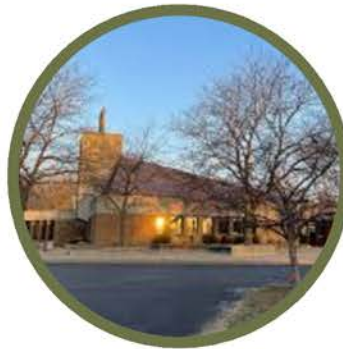
Our Savior's Lutheran