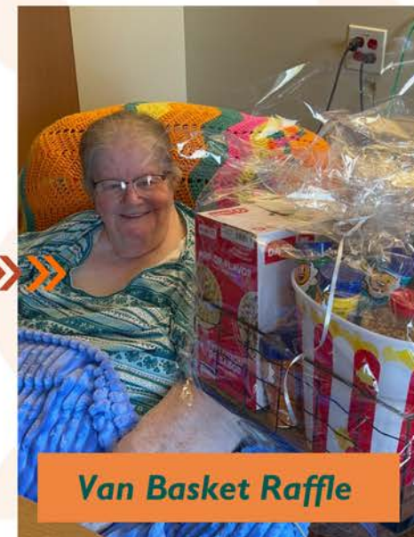
Van Basket Raffle