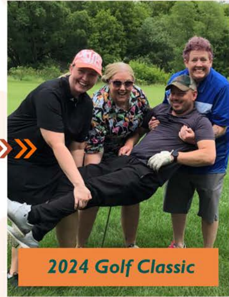
2024 Golf Classic