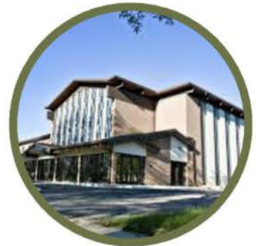
Gloria Dei Lutheran